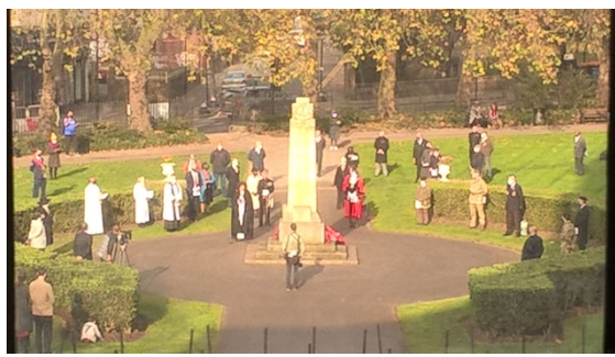
Remembrance Sunday 2020

What happened at Hackney was quite extraordinary considering the circumstances. Traditionally we have always had a large civic remembrance service attended by faith groups, civic dignitaries and representatives of the uniformed services.