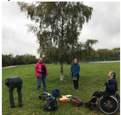
Why so bashful ?

This issue of Bell News has included a number of articles about handbells. One of our Training Officers adopted this unusual ringing posture when having his photo taken: