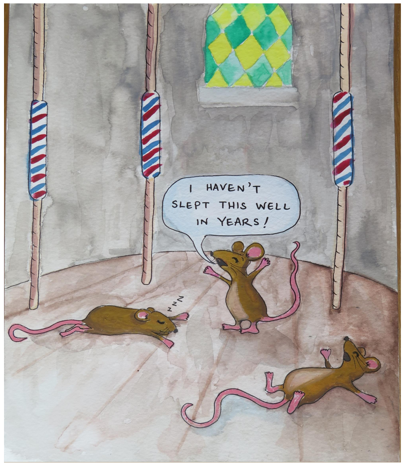
With thanks to Beth Chaudhury