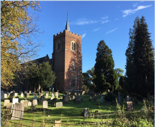
St Mary the Virgin, Stanton Mountfitchet

and Stansted Mountfitchet, both with Hertfordshire spikeøspires: