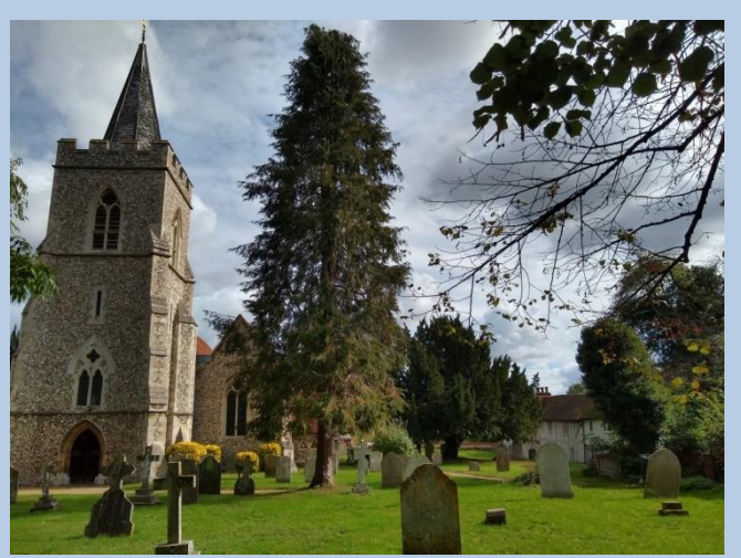
St Mary the Virgin, Manuden