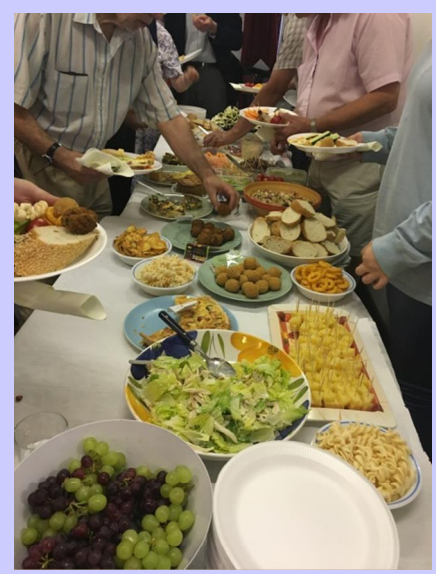
A "sumptuous" tea indeed

This lovely annual event was well-constructed, and displayed the commitment and passion of the ringers and readers (the proceeds go to charity). As always, a sumptuous tea concluded the event!