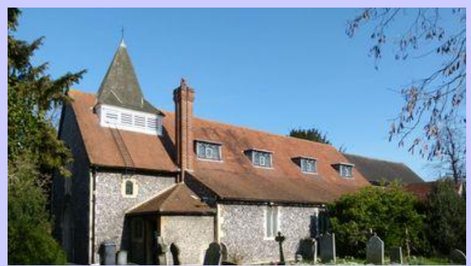
St Mary's unusual 'inset' belfry

On Saturday 17th of August over 20 learners, some on their first outing, convened at Wimbledon Tram Station with helpers and tutors. The first church was St Maryøs Merton Park, a gentle ground-floor ring.