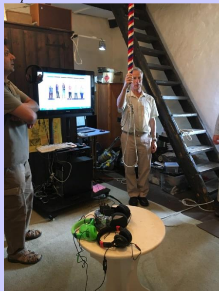
On Monday 8th July one car left Harrow laden with

ringers followed swiftly by another from Bushey. Negotiating the M25, we reached Oxted with plenty of time to enjoy a picnic in the church grounds bathed in glorious sunshine.